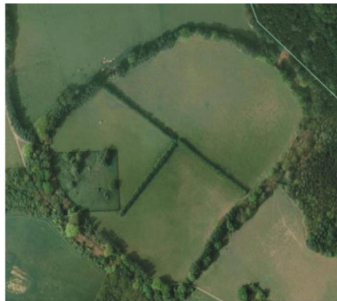
Survey of Dry Hill Camp in 1905 (left) and modern aerial photograph (right)

In 1970 more pipe drain trenches in the south east and south west of the enclosure were dug but in all cases there was no sign of occupation or use of the interior. Tebbutt (1970) noted that the one useful outcome was the confirmation of a north-south trackway passing through the entrances of the camp. A further watching brief during 1994 did not reveal any new information. It can be said that the name of Dry Hill is deeply ironic since the presence of water is clear even with the drainage trenches and some parts could have been quite marshy in the past.