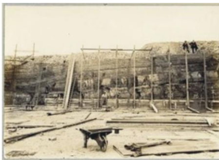
Building the reservoir in the interior of Dry Hill Camp in 1912

Situated as it is so close to all three counties Dry Hill Camp should be of considerable interest to all CBA South East members and further information will be available from the project leaders: