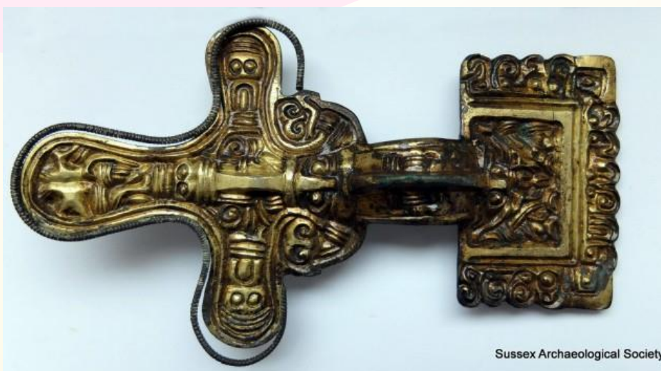
Sussex Archaeological Society

https://www.youtube.com/watch?v=QEDS_n6oi2w