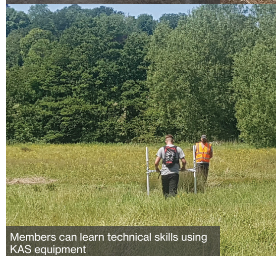
Members can learn technical skills using KAS equipment