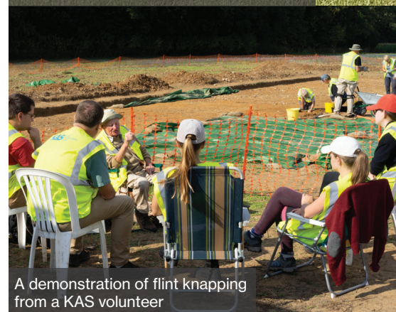
A demonstration of flint knapping from a KAS volunteer